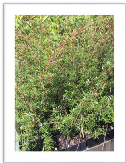
L to R: Ozothamnus diosmifolius , Lomandra confertifolia ssp. confertifolia , Sannantha similis